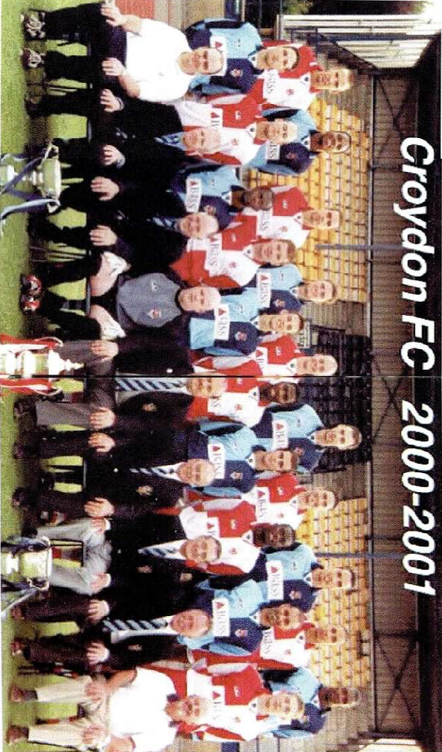
Croydon FC 2000-2001

1975-76 proved to be a history making season as the Club went the whole season undefeated in the League. Forty-two games and yet, Tilbury piped them for the championship. It was only the second time in the